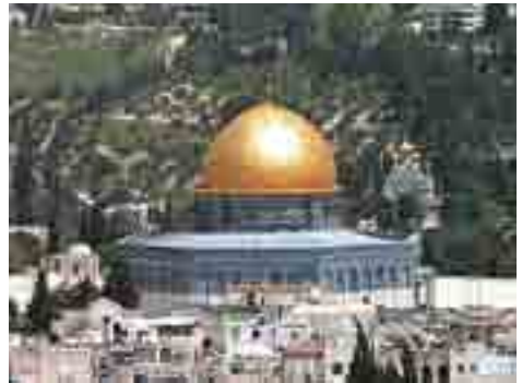
Dome of the Rock

The Dome of the Rock is an Islamic Shrine and major landmark located on the Temple Mount in Jerusalem in the Heart of the Holy City of Jerusalem. It was constructed over the exact location of God’s Holy Temples. The Dome of the Rock was completed between 689 and 691 A.D.